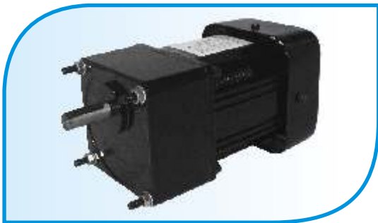
25 watts Motor Frame size 80 mm sq.