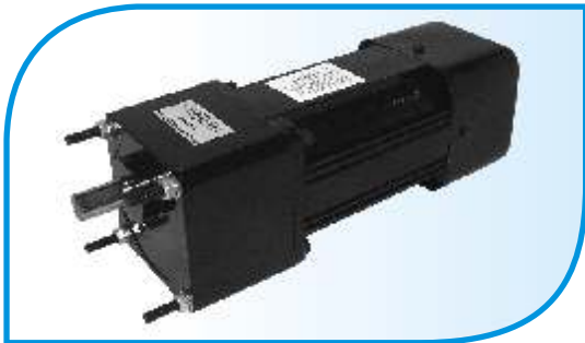
40-200 watts Motor Frame size 90 mm sq.